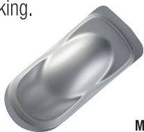
6013 AutoBorne Silver Sealer