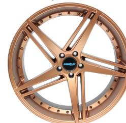
4334 Metallic Bronze tinted 15% per vol. with 4662 candy 2 O Dirt Track Brown

Airbrushing: 4200 Series Colors work best for airbrush colors. Reduce generously with a mix of both 4030 Balancing Clear and 4012 High Performance Reducer. Generally, an equal mix of paint / 4012 Reducer / 4030 Balancing Clear works well. Exact ratios are not required, what is important is atomization. Add enough 4012 High Performance Reducer to achieve optimum atomization with each color.