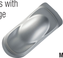
6013 AutoBorne Silver Sealer